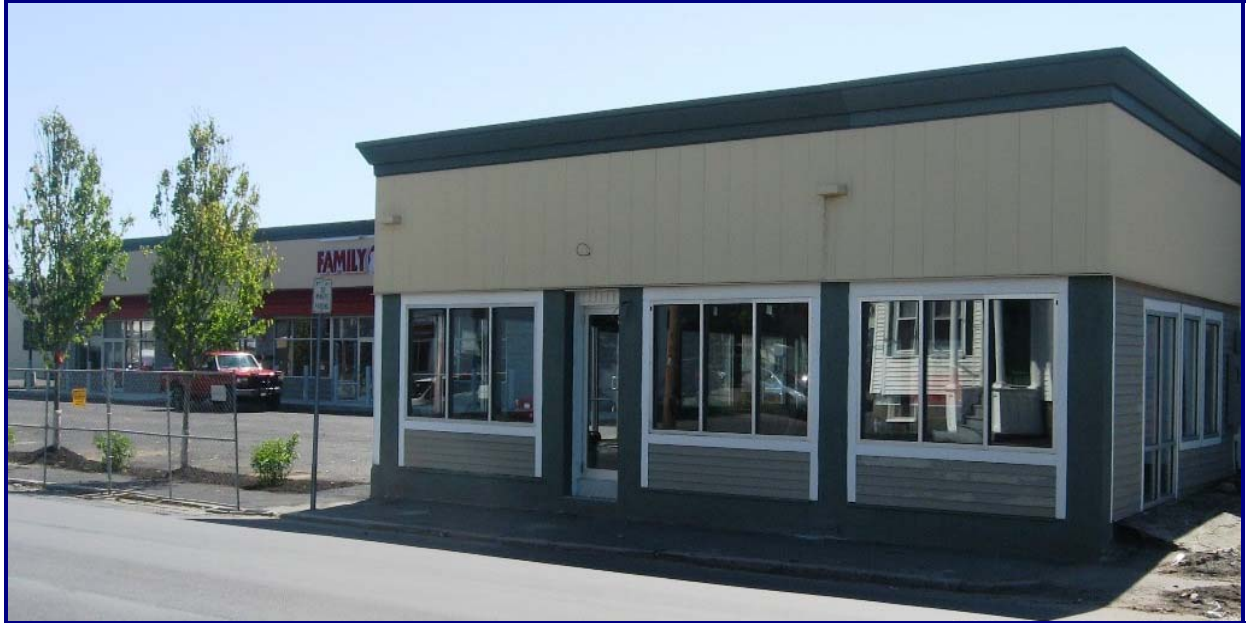
Building "D" 2,450 SF Available Sub-Dividable