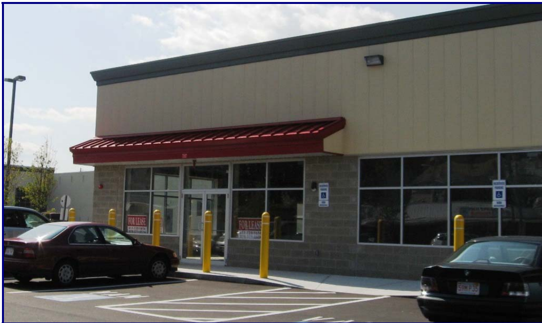
Left Side of Building "B" New 1,800 SF Little Caesar's Pizza with Drive-Thru Opening Spring 2010

Denenberg Realty Advisors – 617-720-5656 – www.DenenbergRA.com