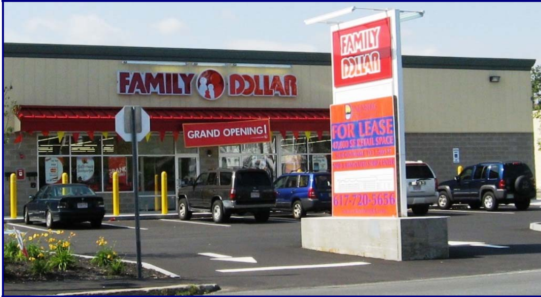
Right Side of Building "B" New 9,180 SF Family Dollar Store Opened September 2009