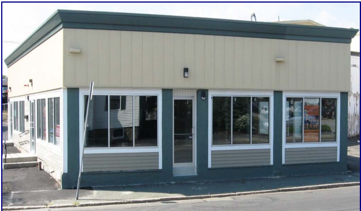
Building "D" 2,450 SF Available Sub-Dividable

Denenberg Realty Advisors – 617-720-5656 – www.DenenbergRA.com