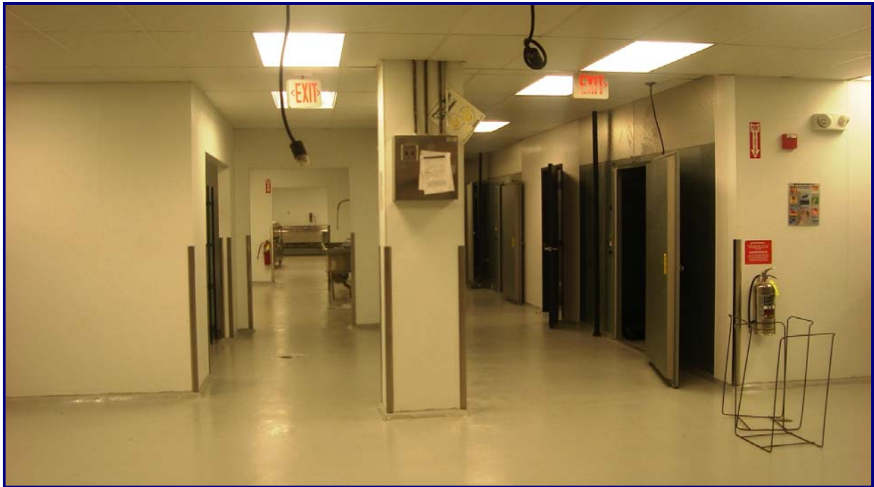
Multiple Refrigerated Walk-Ins