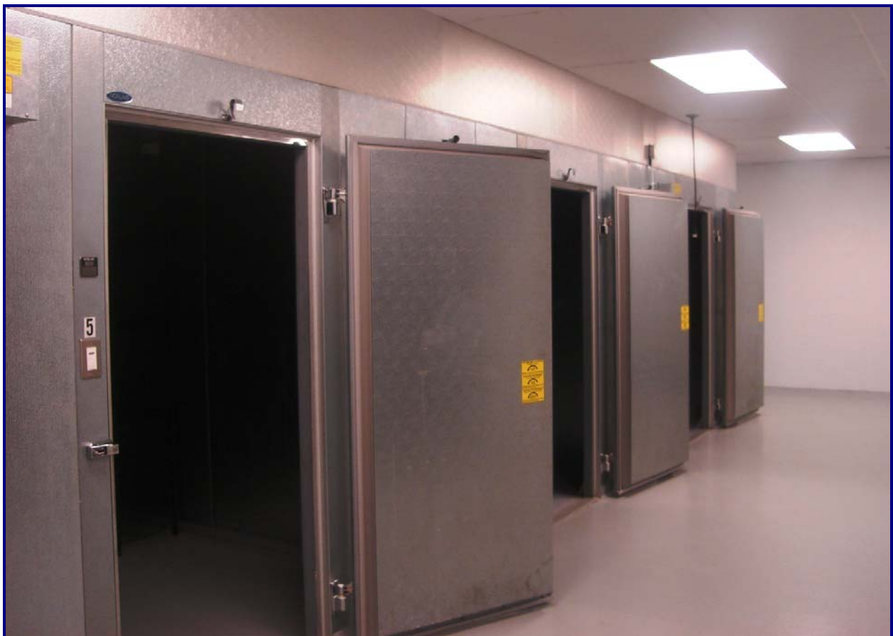
Multiple Refrigerated Walk-Ins