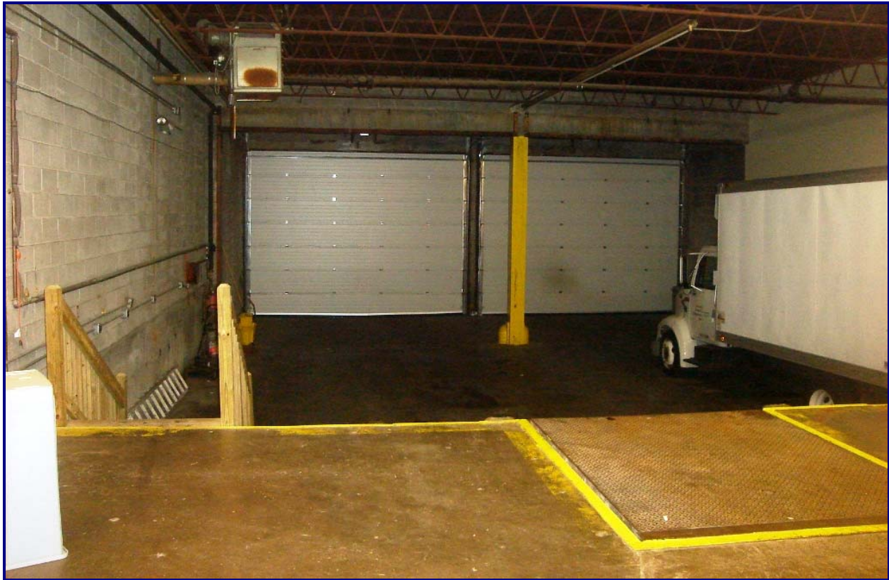
Covered Loading & Receiving Docks